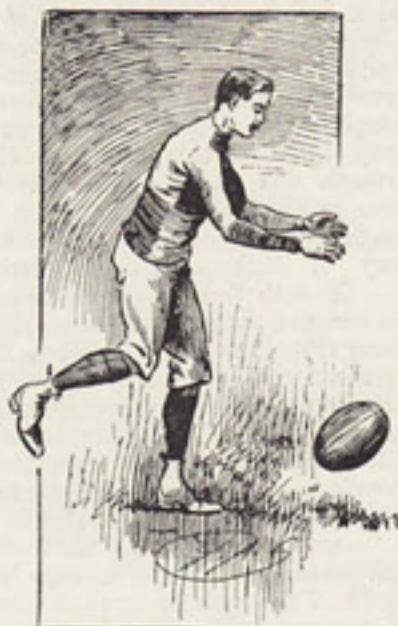
"A DROP KICK."

been put into the field for England for years, the record of the Rose against the Thistle was eight wins against seven, with seven draws.