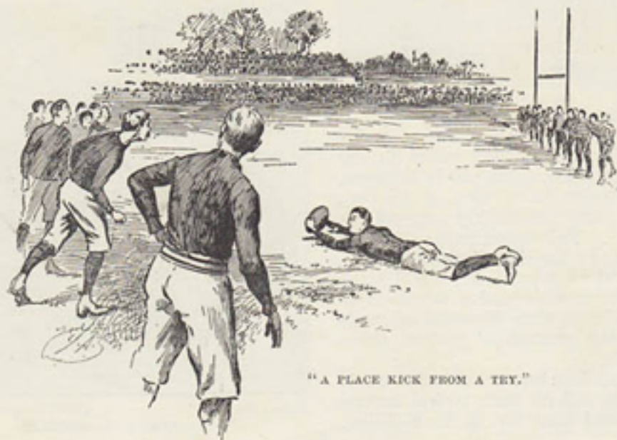
"A PLACE KICK FROM A TRY."